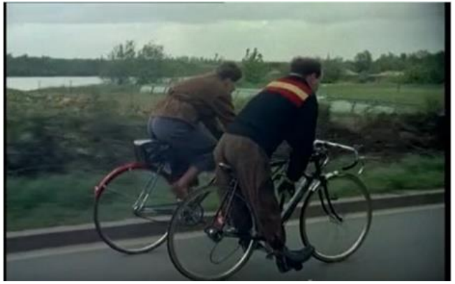
Part of their return journey was along the small trackway in front of St Mary's church and Burlington House Bedford Green – in the distance can be seen the old Vicarage