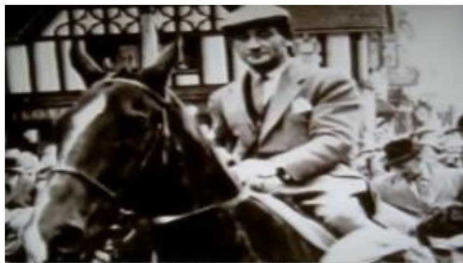
Fred Winter wins Grand National in 1957 and 1962.