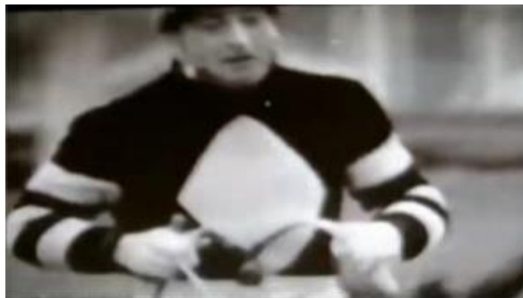
Fred Winter wins Grand National in 1957 and 1962.