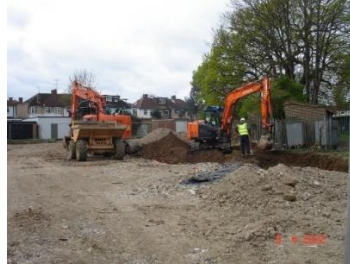
'A little on the history of the Paddling Pool'