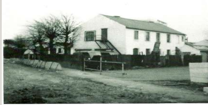
image was one of the buildings that were on site