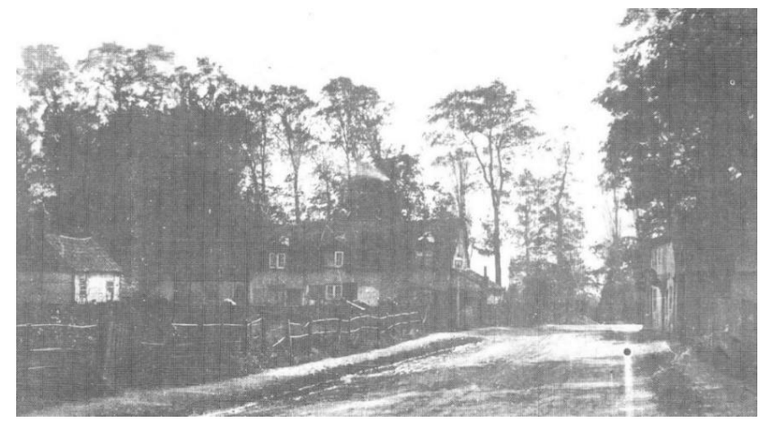
The next item was on Feltham Brook 'conduit'

in 1913, a house number i.e. nr 3 Spring Road – this however does not tie in with the numbering system of today and certainly not the houses.