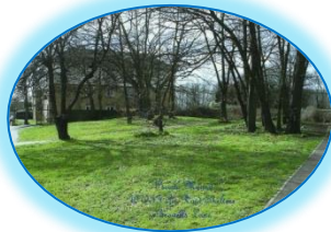
Air Raid Shelters