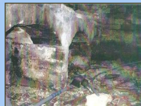
bricked up ovens