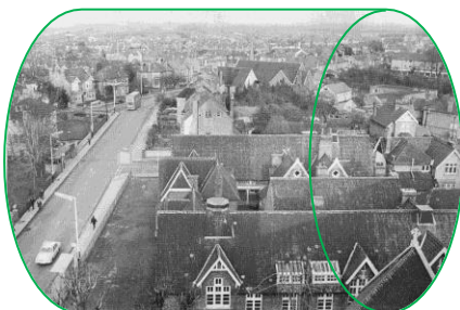
View of Hanworth Rd School from St Catherine's Tower

The next history group meeting is Tuesday 3 rd September 7-50 at Christ Church Feltham